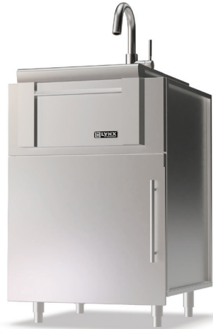
LYNX SINK BASE

Crafted for versatility, Lynx Outdoor sink bases pair effortlessly with Lynx sinks or other drop-in options to suit your outdoor kitchen vision.