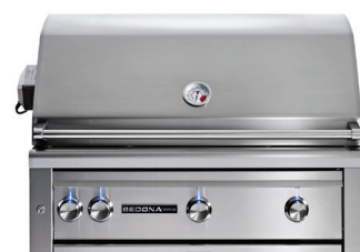
SEDONA BY LYNX™ GRILLS