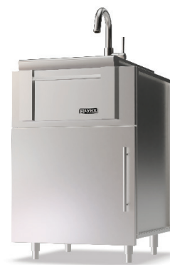
LYNX SINK BASE LEFT AND RIGHT HINGE