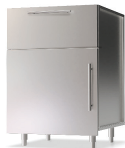
DRAWER AND DOOR BASE 12" WIDTH AVAILABLE