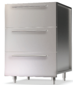
3 DRAWER BASE

Smart storage meets rugged design in these functional cabinets, crafted to keep tools, accessories, and ingredients close at hand. Their form and finish complete the outdoor kitchen experience.