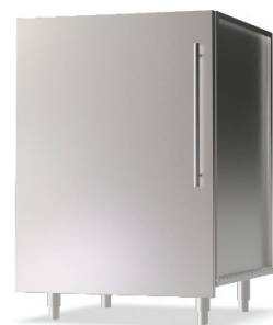
FULL DOOR BASE LEFT AND RIGHT HINGE