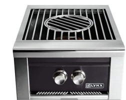
POWER BURNER Shown in Obsidian