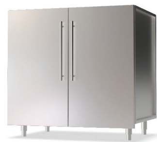
DROP-IN SINK BASE

Crafted for versatility, Lynx outdoor sink bases pair effortlessly with Lynx sinks or other drop-in options to suit your outdoor kitchen vision.