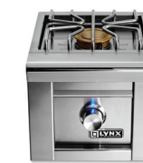
SINGLE SIDE BURNER