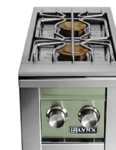
DOUBLE SIDE BURNER Shown in Desert Sage