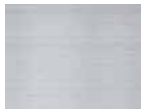
SS Silver Shadow